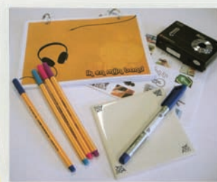
insight in the daily life of people