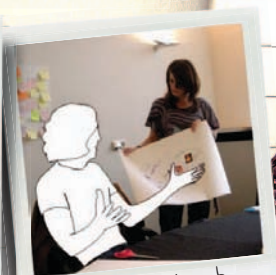
stories about motivations